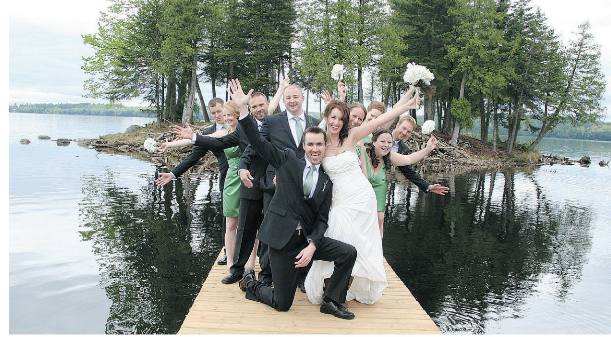
At Calabogie Peaks Resort, couples can exchange their wedding vows on an island in Calabogie Lake.